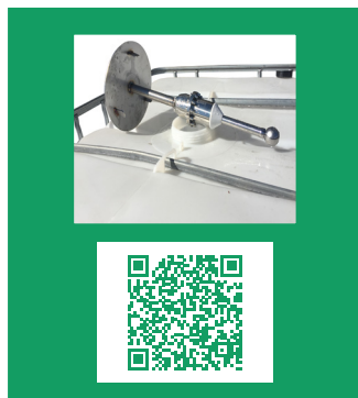
Aqua Tools Tote Blaster