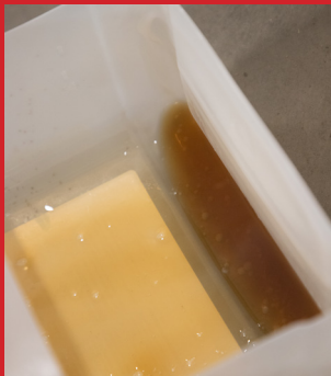
Liquid residue in container