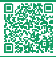
Aqua Tools Tote Blaster