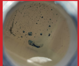
Dried residue inside container

PO Box 1928, Apex, North Carolina 27502 | 877.952.2272 | info@agrecycling.org | agrecycling.org