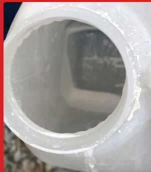
Dried formulation on thread