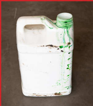
Dried formula on container