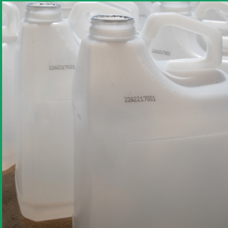
Container, thread, and lip are clean