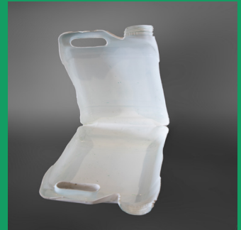
Inside is clean and dry