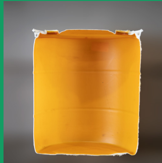
Inside stained but rinsed clean