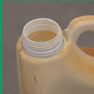
Handle and neck stained but clean