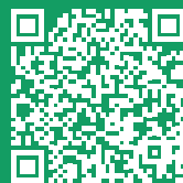
AquaTools Tote Blaster